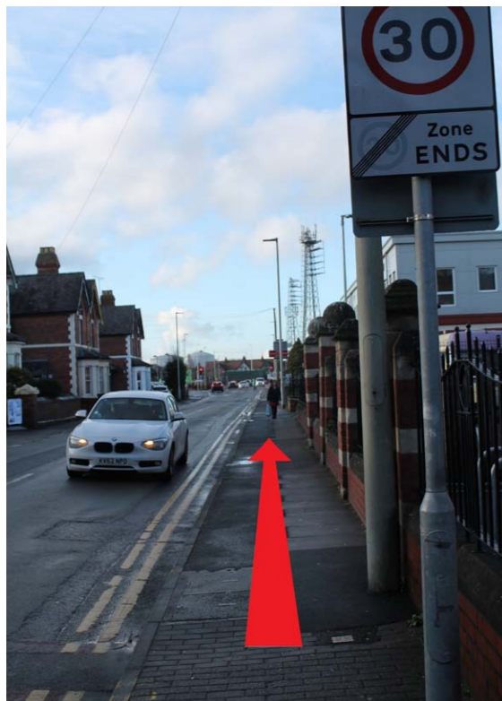
Turn right onto Blackfriars Street and walk until you reach a pedestrian crossing press the button and wait for the signal to cross.