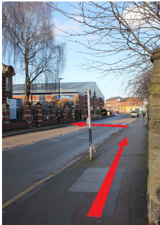
Cross the Zebra Crossing and walk left back down Widemarsh Street.