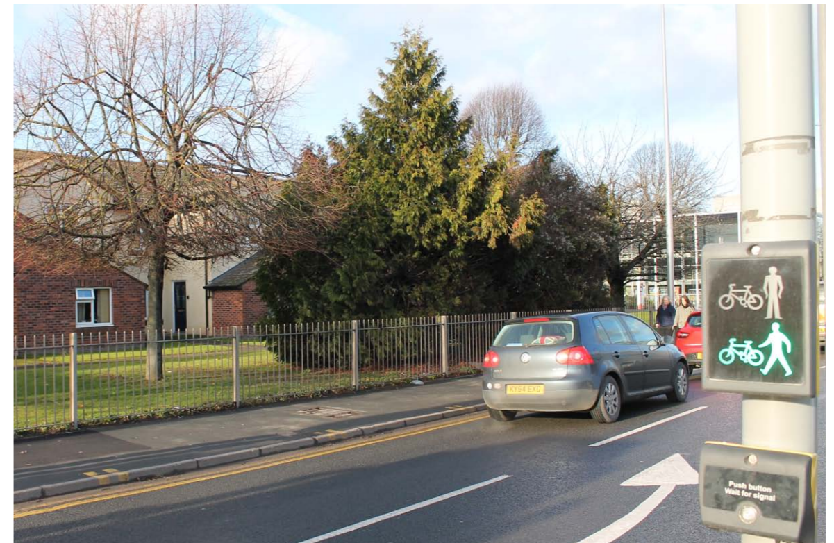
Make sure to wait until the second set of lights display the signal to cross . Now turn right and walk up Edgar Street.