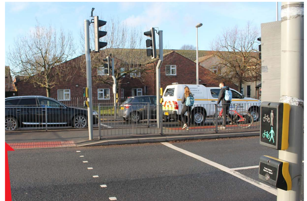
Continue along Blackfriars Street until you reach another pedestrian crossing. Press the button and wait for the signal to cross.